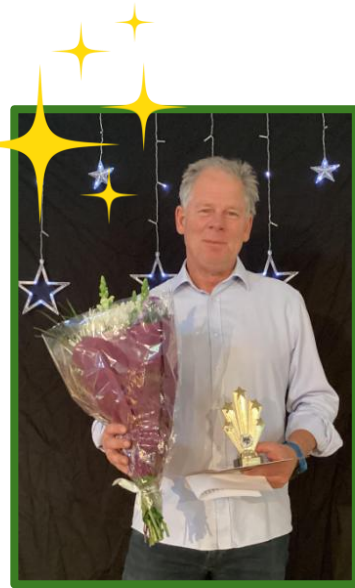
Pride of Beenham Award Recipients